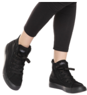
Black Hip Hop sneakers for all levels. MUST be ordered through FNC.