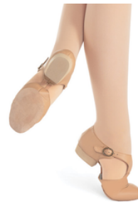
Pedinis for Lyrical (must be ordered through FNC)

Any style solid color leotard, dance/exercise tops, leggings, tights, booty shorts. (All in solid colors, no patterns.) There can be NO clothes worn over dance clothes. No baggy teeshirts, sweatshirts, or sweatpants will be allowed in class. Hair pulled neatly back off the neck and out of face (pony tail, braids, or bun) Jewelry is not allowed except for small earrings. Please see examples of dress code friendly options above. Tan pedinis must be ordered through Front & Center for the correct style.