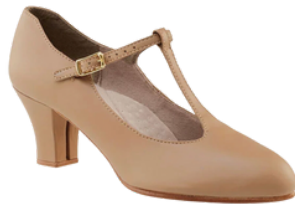
Character Shoes for Theatre Dance Level 3/4