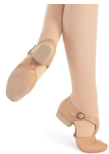
Pedinis for Theatre Dance 2 (must be ordered through FNC)

Level 3/4: Tan Character Shoes, no more than 3 inches high. T-strap recommended